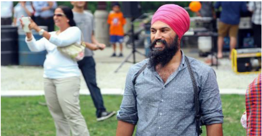
Canadian politician Jagmeet Singh at his annual community BBQ in 2014 at Wildwood Park in Malton, Ontario.

one. Or, “Wouldn't it be easier and safer for you all to just tell people who