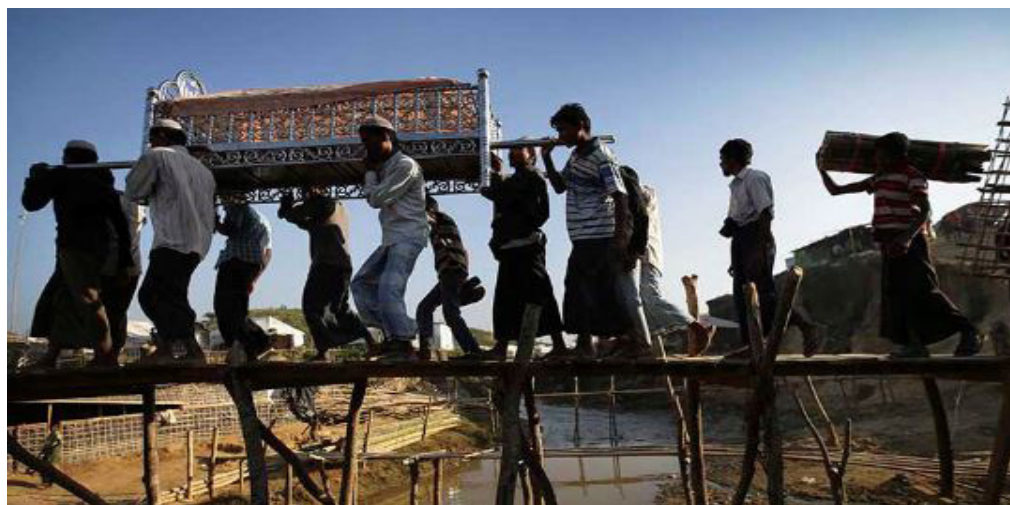
Rohingya Muslim men carry a body to a cemetery in Kutupalong refugee camp on Nov. 26, 2017, in Bangladesh. More than 600,000 Rohingya Muslims fled persecution in Myanmar.

At the end of the day, I believe we know in our hearts what is right and what is just. I think we also know intellectually how hard it can be to do the right thing when the stakes are high and the outcomes are uncertain. This is why Jagmeet Singh received so much love for his compassionate response to hate.