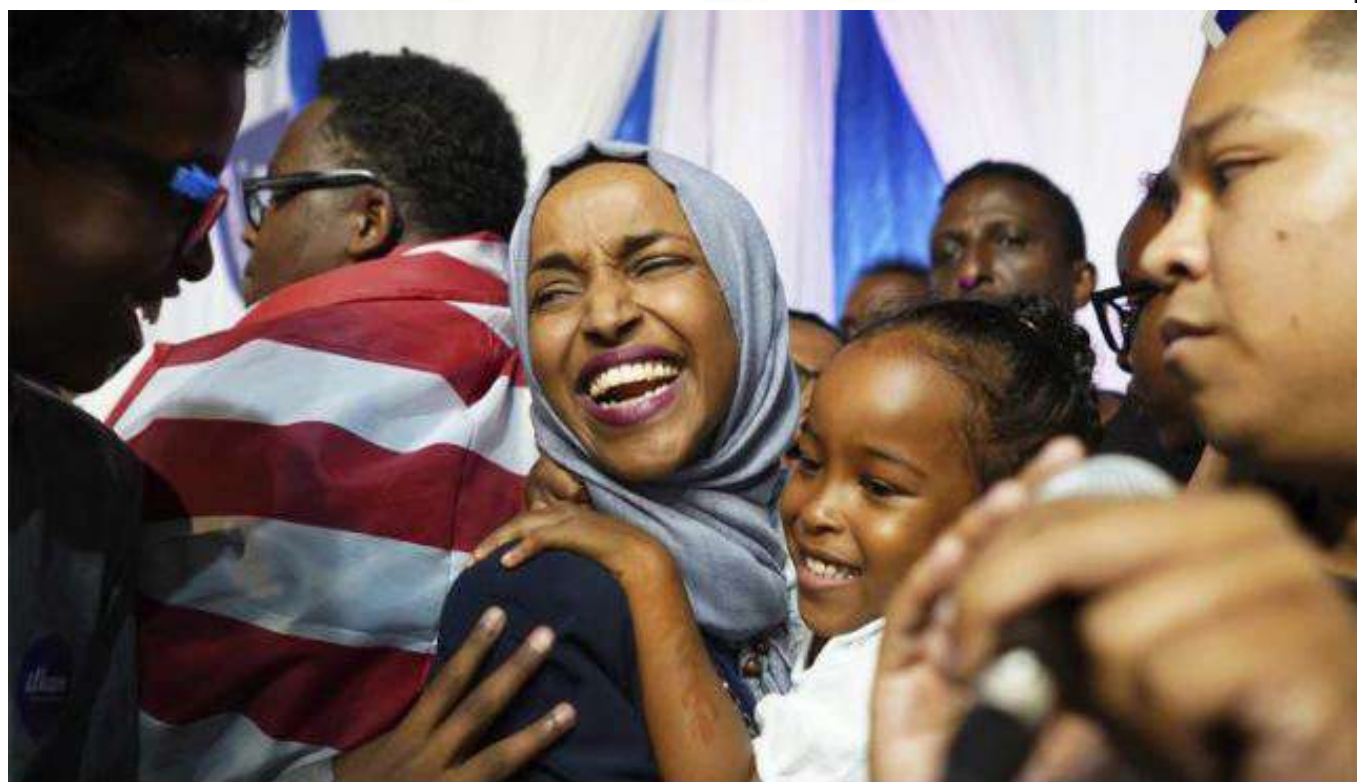
Minnesota state Rep. Ilhan Omar, center, celebrates after her congressional 5th District primary victory on Aug. 14, 2018, in Minneapolis.

9/11, African American Muslim communities calmed the fears of their