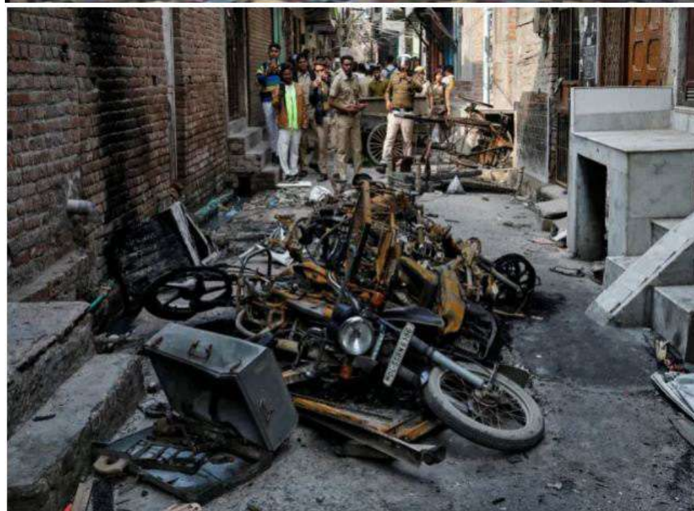
Police in New Delhi photograph burnt out properties owned by Muslims in a riot-hit area