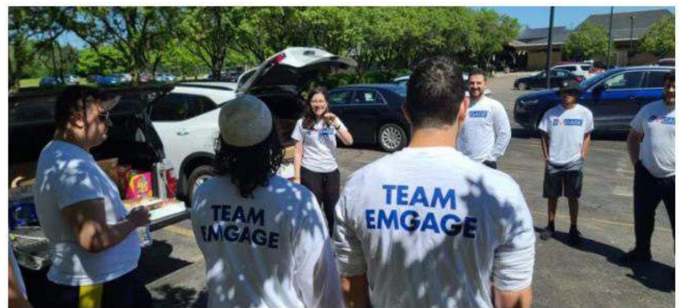
Emgage Michigan workers organize before knocking on doors in Detroit suburbs before August 2022 primaries.