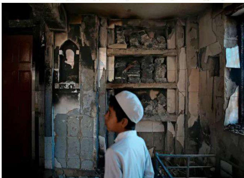
In this February 27, 2020 photo, a boy stands inside a mosque torched during Delhi riots

women-led sit-in at New Delhi’s Shaheen Bagh being the epicentre. Meanwhile, several BJP leaders made inflammatory speeches – even threatening violence – and called to forcefully